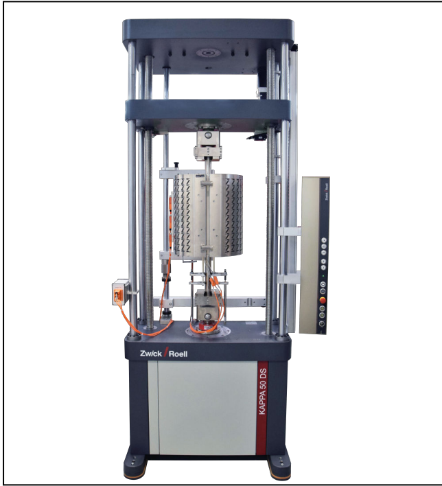
Kappa 50 DS